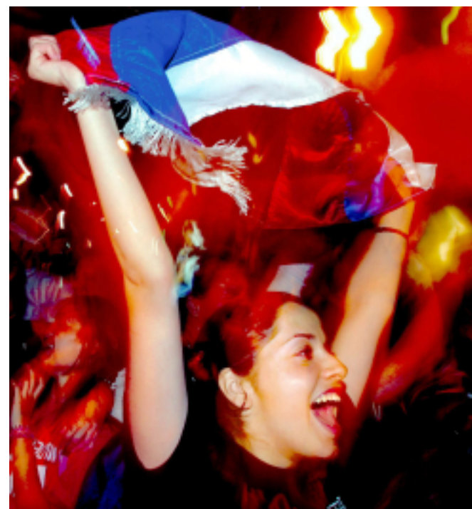
➤ CHANGING TIMES Belgrade's club scene is thriving, above, but the city has more historic attractions, such as the mighty Kalemegdan fortress, below, and its monument to The Victor, right, protector of the city

Belgrade attracts lots of internationally renowned DJs and the bars are open well into the